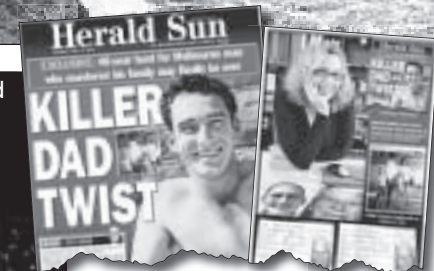
Tuesday's Herald Sun